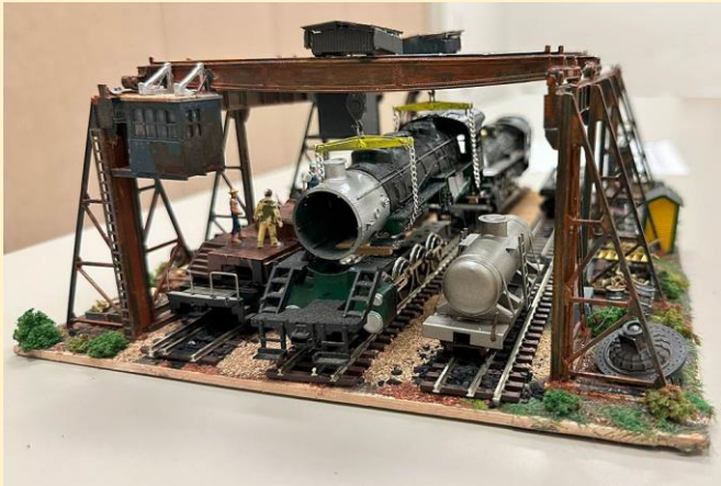
Bill Chamberlain Outside Crane Structure