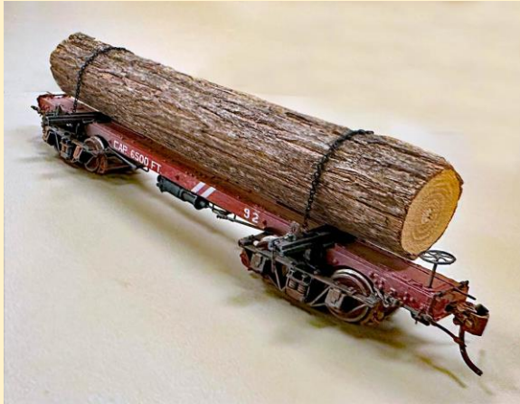
Jim Spice SN3 Skeleton Log Car #92