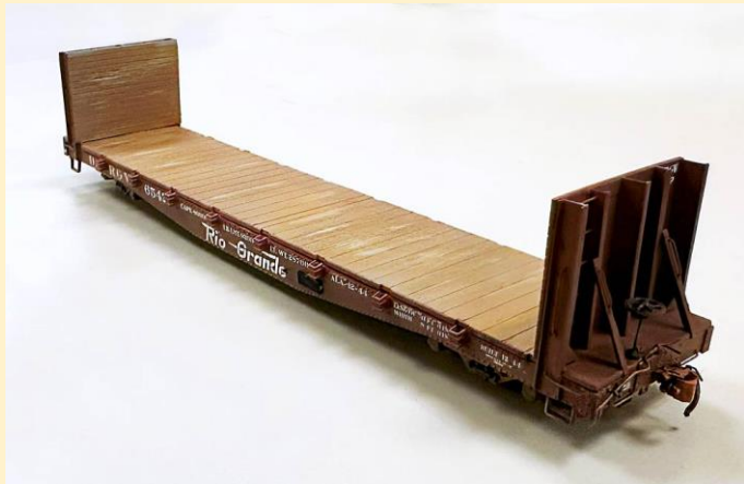
Jim Spice SN3 Bulkhead Flat Car #6542